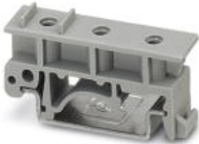
Foot element, Color: gray

Please be informed that the data shown in this PDF Document is generated from our Online Catalog. Please find the complete data in the user's documentation. Our General Terms of Use for Downloads are valid ( http://download.phoenixcontact.com )